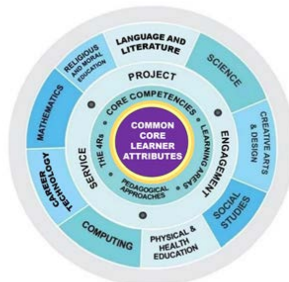
Figure 1: Features of the CCP